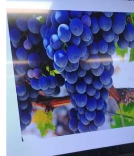
pictured in this article.

We tried two whites followed by a rosé. The next two were reds, one bottle of each demonstrated a defect. Wine four was musty/cloudy and five had TCA, being corked. The last wine was decanted in a very unique vessel, a coffee pot, which goes to show that even under duress, the wine club can accommodate any speaker. Problem solved!